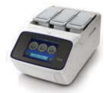
ProFlex PCR System