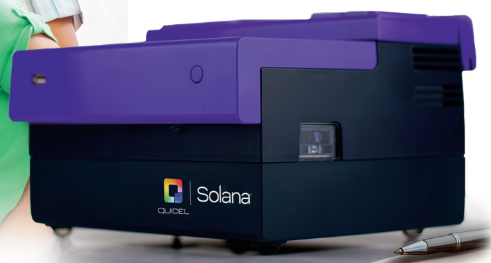
Solana RSV + hMPV Assay run with the Solana bench top instrument a mere 9.4" x 9.4" x 5.9"