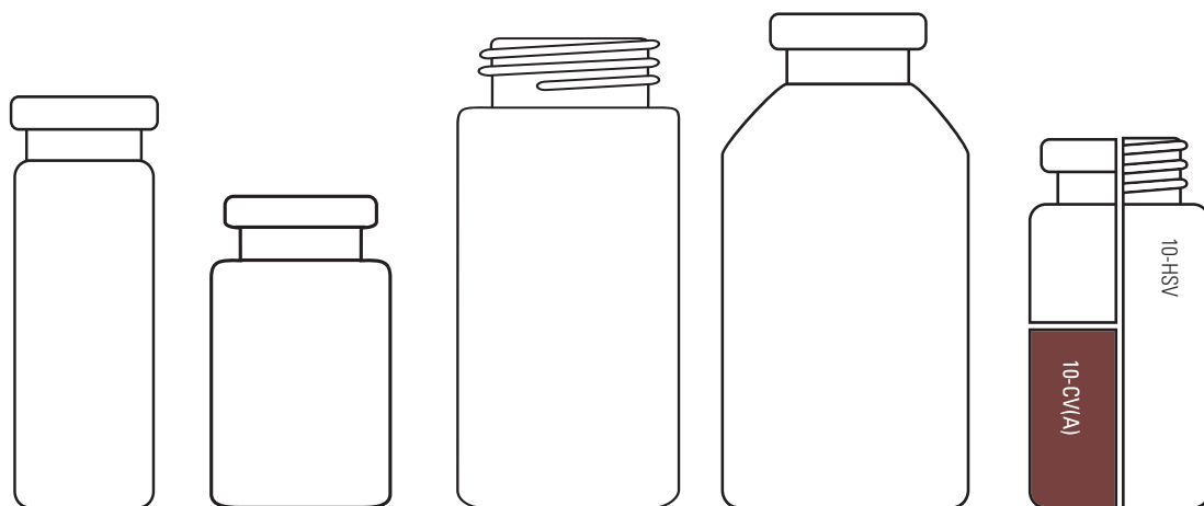
Part No. Dimensions 9-CV 18x50mm 6-CV 22x38mm 20-EPSVCA 27x57mm 27-CV 30x60mm 10-CV/10-HSV 22x45mm