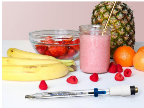
Figure 3: InLab Max Pro-ISM sensor to measure the pH of fruit juice.

Calibrate the sensor using buffers that bracket the sample range (in this case, MT pH buffers of 2.00, 4.01 and 7.00 are used). Record the calibration slope and offset value for the electrode. A slope value of 95 -105 % and an offset of 0 \pm 30 mV ensures reliable measurements.