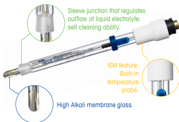
Figure 2: InLab Max Pro-ISM pH sensor.

This sensor has HA type glass membrane (high alkali glass) which makes the sensor robust. Measurement at high pH values with minimized interference of alkali errors is possible due to this glass membrane. The sensor has a built-in temperature probe and provides Intelligent Sensor Management (ISM) technology, allowing users to accurately capture all critical measurement parameters. The specialized design and overall sensor technology of the InLab Max Pro-ISM ensures direct sample measurement of fruit juice, without the need for undue dilution of the sample with water. It enables reliable pH monitoring for a consistent batch production.