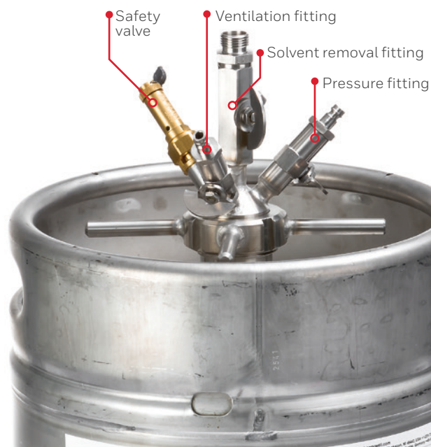
Dispensing head for containers with integrated dip tube