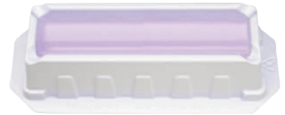
25mL Reagent Reservoir