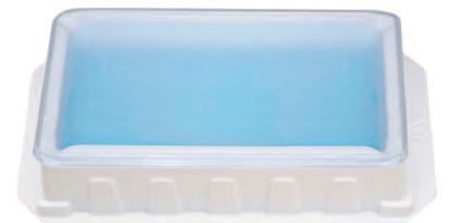
100mL Reagent Reservoir with Lid