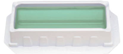
50mL Reagent Reservoir