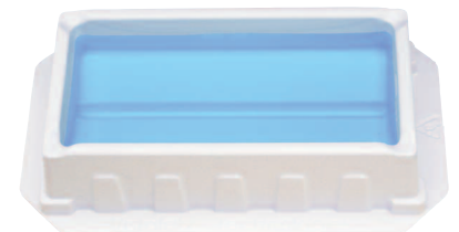
100mL Reagent Reservoir