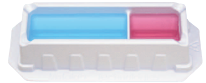
25mL Divided Reagent Reservoir