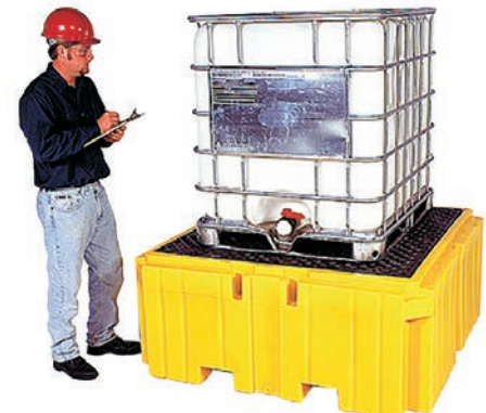
IBC not included with pallet purchase

Compliance: Help meet SPCC and EPA container storage regulations